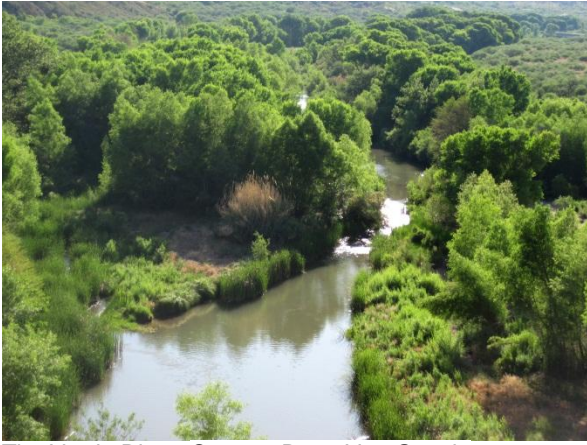
The Verde River.

40 miles downstream, just above Horseshoe Reservoir, created by Horseshoe Dam.